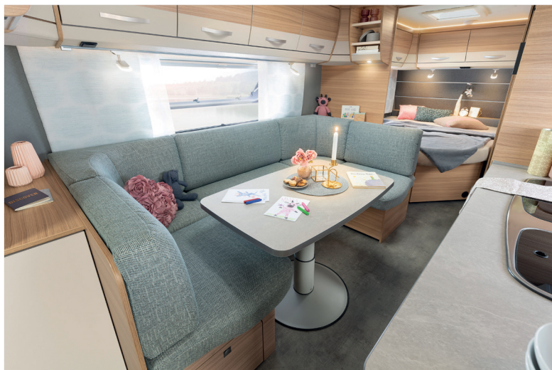
NOMAD COLOURS DIFFER FROM THOSE SHOWN