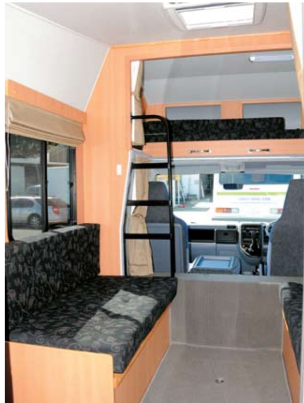
Above: Looking forward from the rear lounge Left: There are dedicated drawers for crockery and cutlery and a pull-out pantry

The base vehicle is a Mitsubishi Fuso FE150E3 3.9-litre Turbo common rail diesel, 148hp, five-speed manual. The cab seating is quite upright, which offers excellent driver visibility and comfort. It has a driver's airbag, cab aircon, central locking, heated electric exterior mirrors and can be upgraded with leather upholstery and wood-grained trim. There is direct access from the cab to the motorhome, although those of us who are less agile than we were may choose to use the cab doors when the weather is fine. It is nimble to drive and I was soon quite confident to keep my place in the traffic flow on the open road, overtaking where necessary to avoid slower vehicles. It came as a surprise to me to observe how much respect car drivers paid to me in this larger,