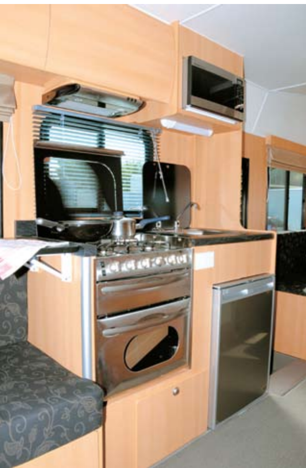
Above: The 'Kiwi U-shaped lounge' can have either a smaller one-legged table or a large two-legged version Left: The kitchen layout is functional, with a microwave above the sink and the Waeco fridge below. Two fold-down bench flaps increase the kitchen work area.

mounting the Thetford cassette toilet. Over the toilet is a Cleo fold-down hand basin with a mirror-fronted cabinet above. In the corner beside the cabinet is a vertical rail for the shower handpiece. A solar light fan vent in the roof and a slide-opening window handle light and ventilation issues. Basically, it has everything required in a compact space. The galley kitchen layout is very functional. Above the glass-lidded sink is the Sharp microwave, below is the silver Waeco 12/230-volt 108-litre fridge, and to the left is the Smev oven with separate